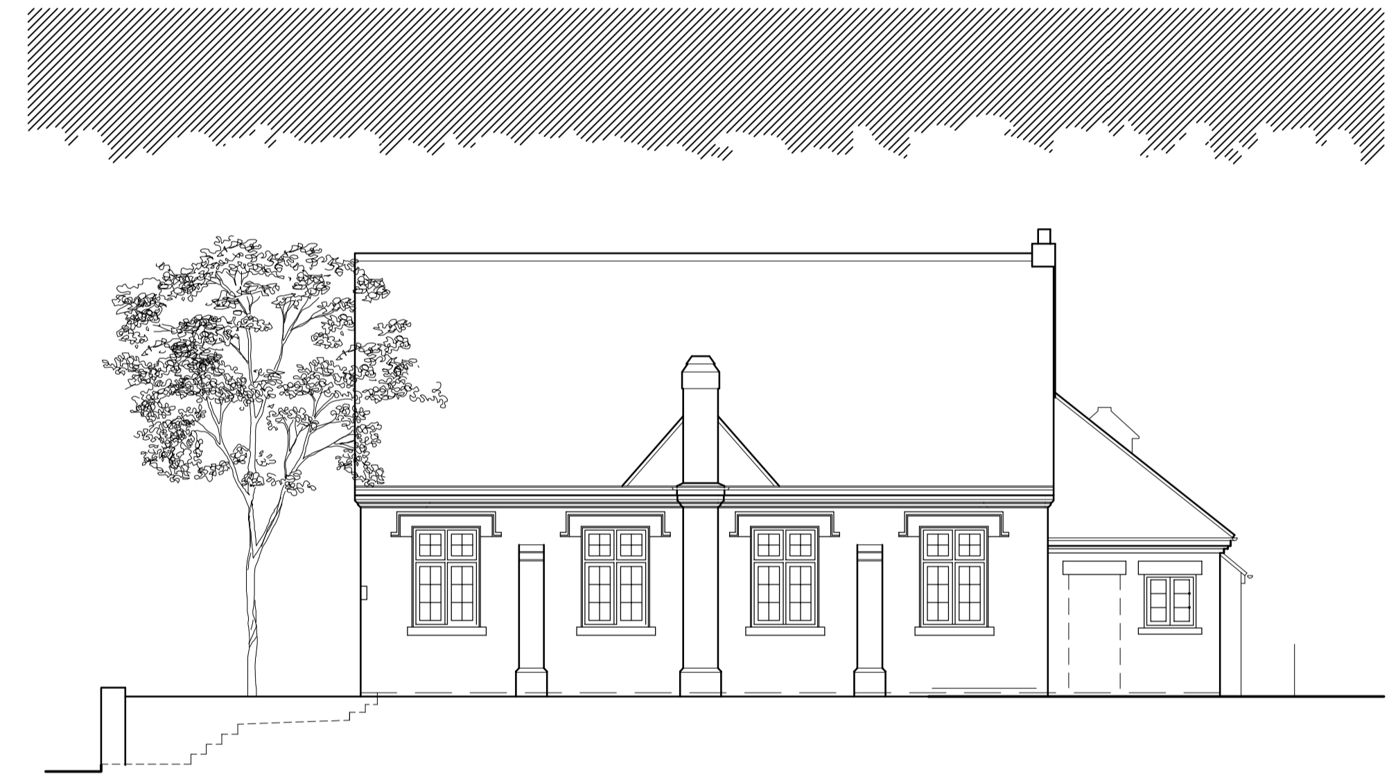
SIDE ELEVATION (NORTH EAST) 1:100