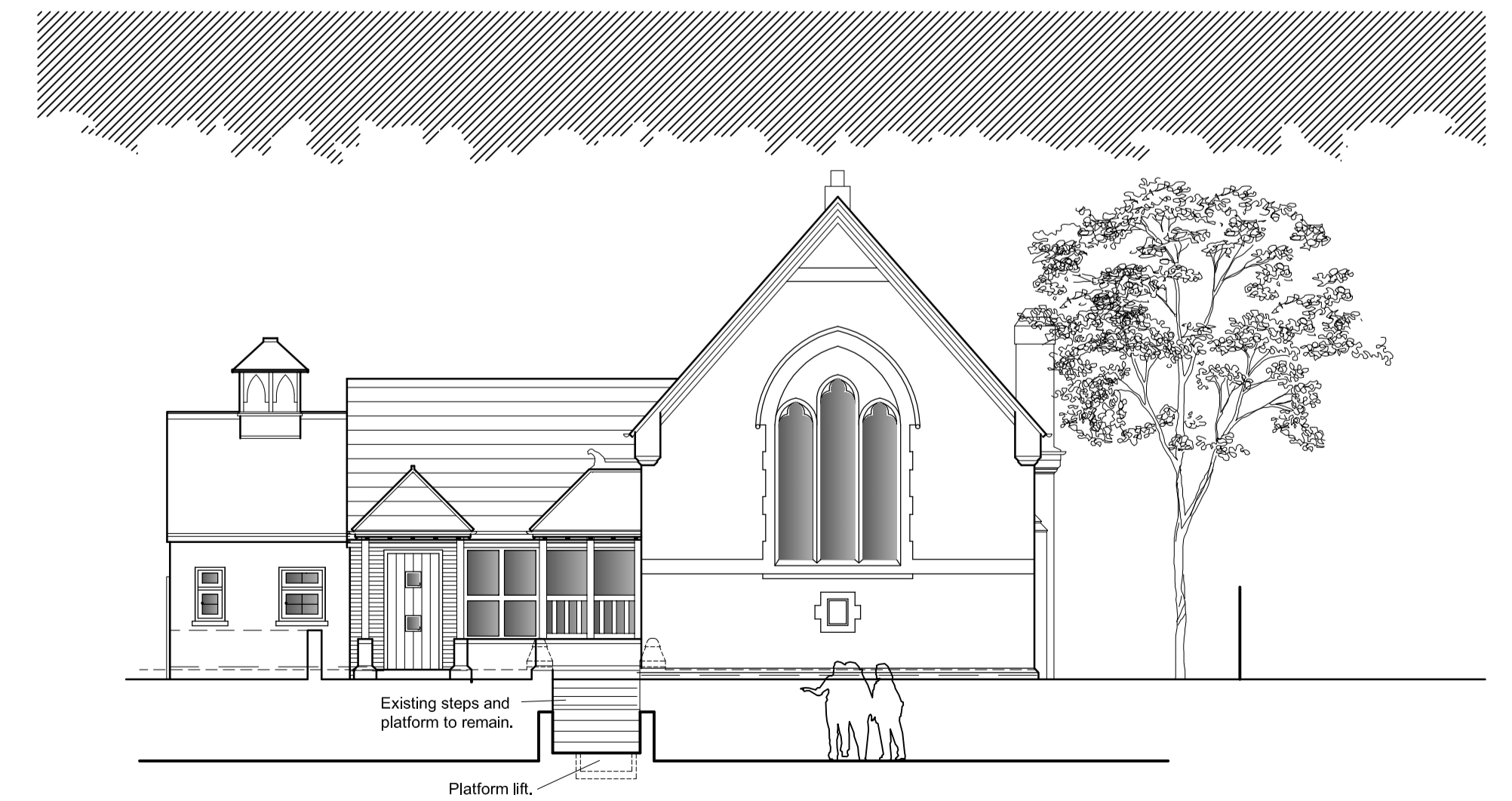
FRONT ELEVATION (SOUTH EAST) 1:100