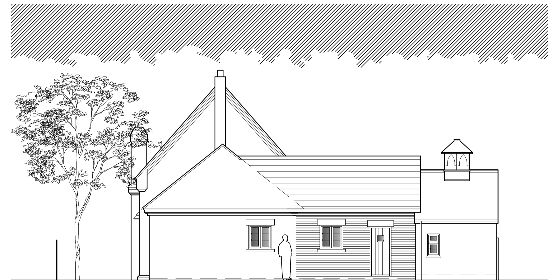
REAR ELEVATION (NORTH WEST) NTS

NOTES Survey completed with limited access to certain areas. Where access was limited, estimations had to be made. All dimensions to be checked on site. It is recommended that a Topographical Survey is carried out so that an accurate plans showing all levels and heights can be achieved. Drawings and documents to be read in conjunction with one another. These drawings are prepared for the purpose of a PLANNING APPLICATION only.