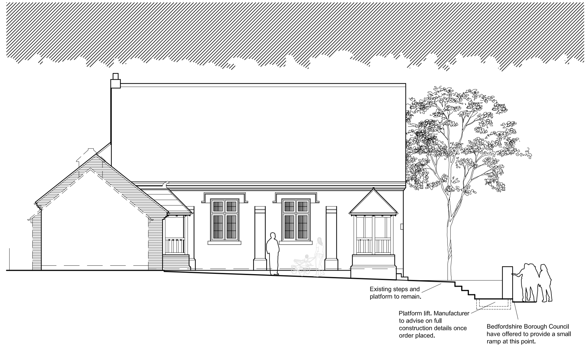
SIDE ELEVATION (SOUTH WEST) 1:100